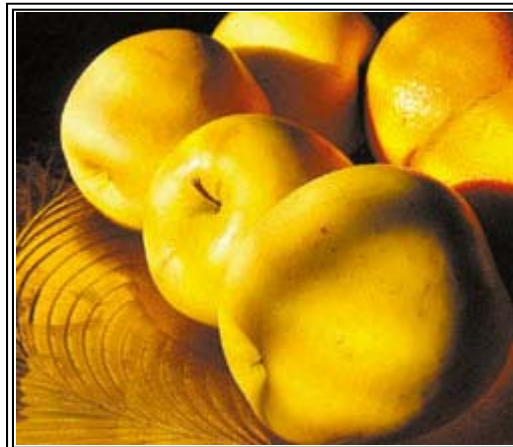
A still life of apples is one of the photographs by Ian Zuckerman exhibited at the “Shenandoah Photography II: New Directions” show at the Shenandoah Arts Council in Winchester. The show opens today and continues through July 2.

“I got involved in computer graphics in 1980,” she said. “That was before the desktop.”