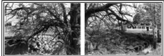
These photos are samples of the exhibit opening today at the Shenandoah Arts Council building in Winchester.

But just a couple of centuries ago, it was the water source that established the city. Its banks were the places that settlers drew fresh water and fished for food. And before the settlers, Native Americans surely knew the stream as a source of sustenance and life.